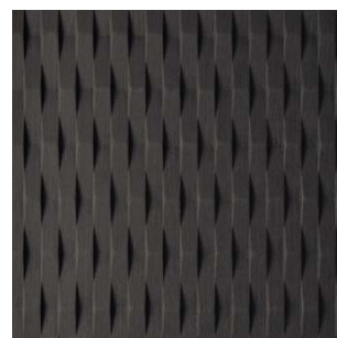
Black Fineline veneer